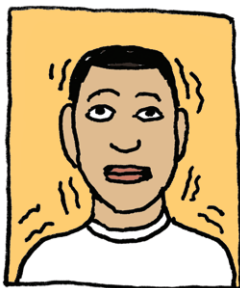
Shaky or dizzy