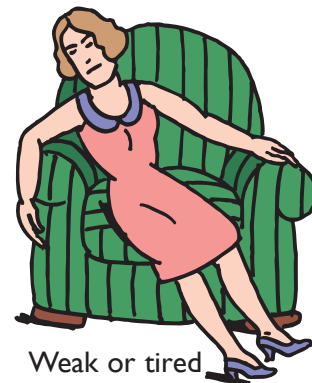
Weak or tired